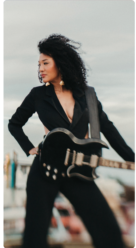
Live performance by Grammy Award-winning jazz and soul singer-songwriter, Judith Hill

* Sponsorship commitments must be received by Friday, February 14, 2025, to ensure inclusion in the Benefit booklet.